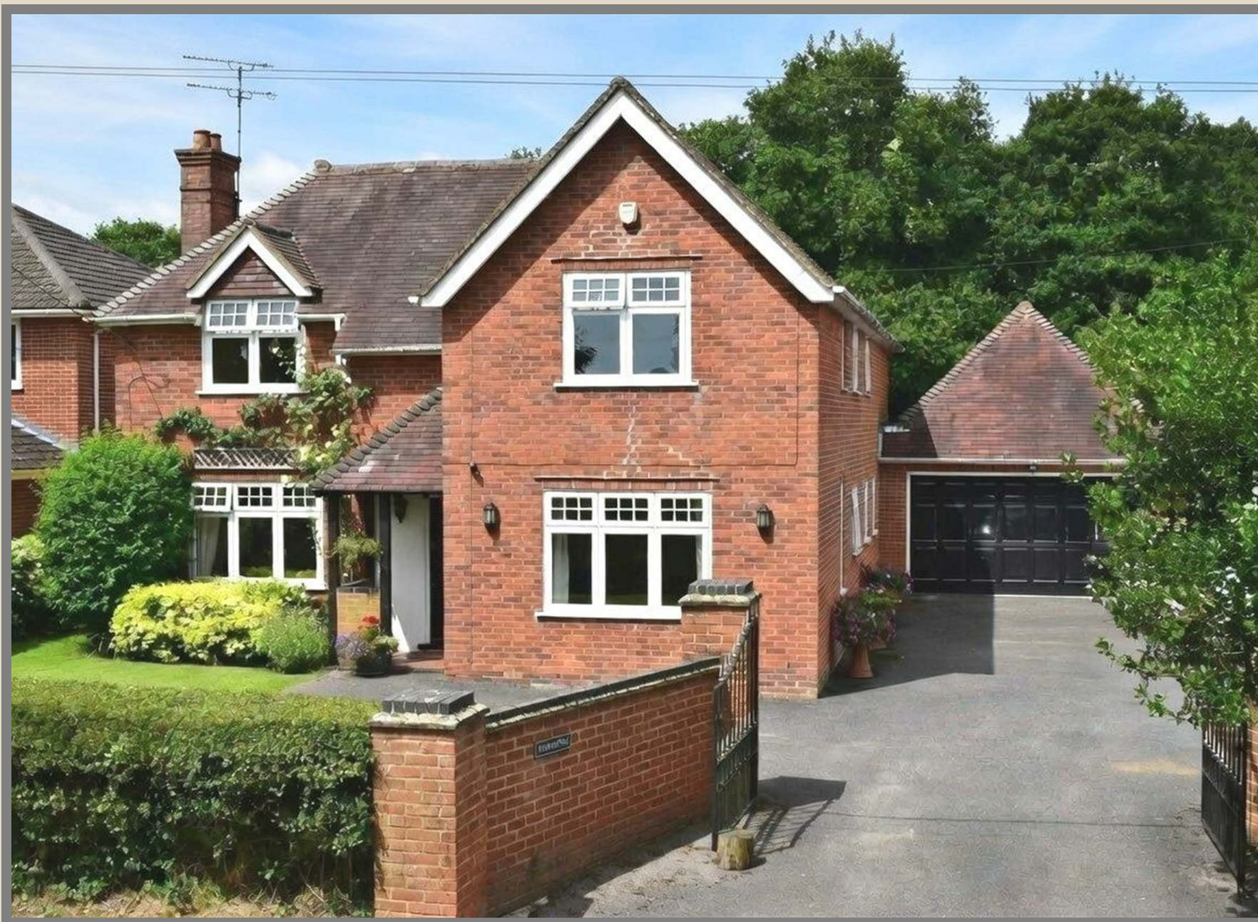
HYAKINTHOS, Newbury, West Berkshire , RG7 6SU